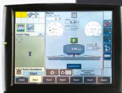
IntelliView™ IV color touchscreen display