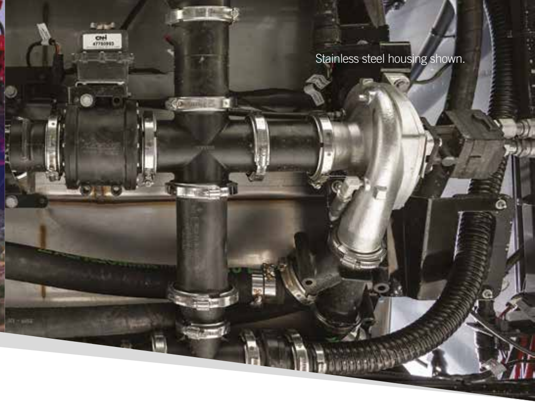
Stainless steel housing shown.