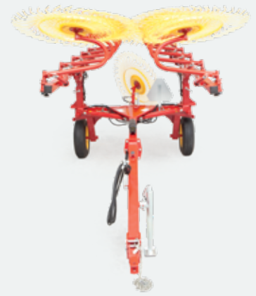
Folded for narrow transport