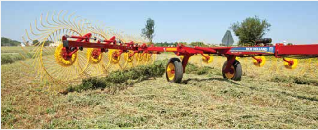
Field operating position