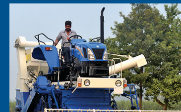
TOT COMBINE HARVESTER