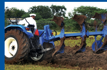
REVERISBLE MB PLOUGH