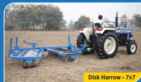
Disk Harrow - 7x7