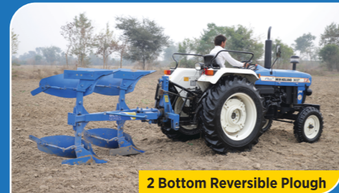
2 Bottom Reversible Plough