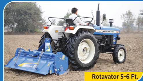
Rotavator 5-6 Ft.