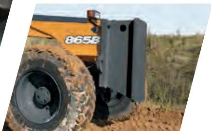
FRONT PUSH PLATE