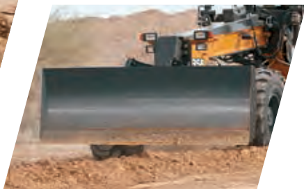
FRONT DOZER BLADE

CASE offers a variety of grader attachments, including: