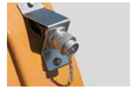
Front Electric/ Multi-Function