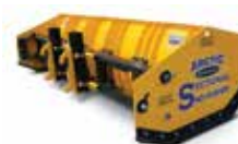
Arctic® Sectional Sno-Pusher™

SEE OUR FULL LINE AT CASECE.COM/ATTACHMENTS