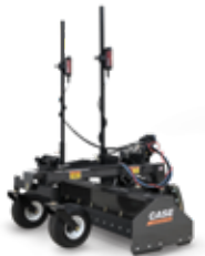
Laser Grading Box