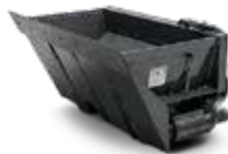
Side Discharge Bucket