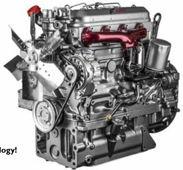
FPT S8000: proven technology!

At the heart of the VI 10D is the FPT S8000 Tier III engine, delivering high torque and dependable performance in all soil conditions. Its turbocharged and after-cooled design ensures dense intake air, efficient combustion and reduced fuel consumption. A high-mounted pre-cleaner protects the engine in dusty environments, extending component life. The hydrostatic drive system provides smooth, infinitely variable speed control, allowing the operator to match machine pace precisely to compaction needs.