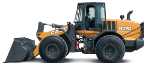
Large Wheel Loaders