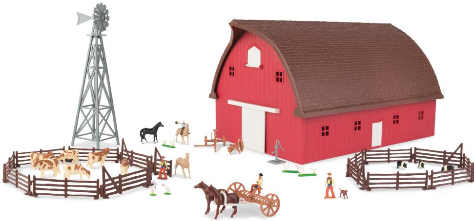
1:64 Farm Country Gable Barn 46765 Pack: 2 - Age grade: 3+ SRRP: $64. 95 EA