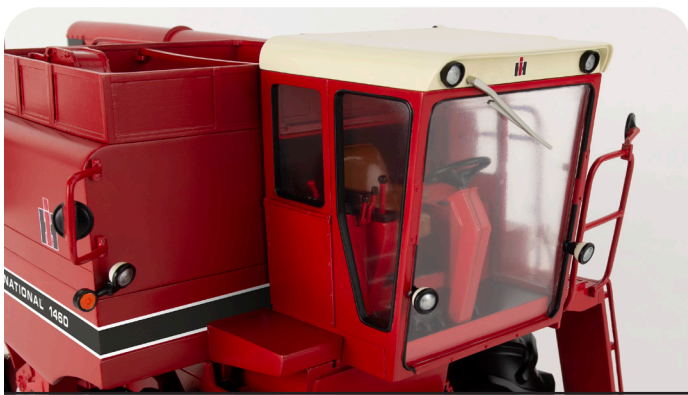
Detailed cab interior & opening cab door