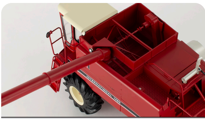
Die-cast grain bin and pivoting unloading auger