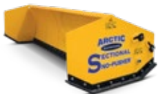
Arctic® Sectional Sno-Pusher™