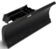
6-Way Dozer Blade