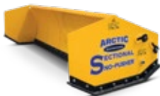
Arctic® Sectional Sno-Pusher™