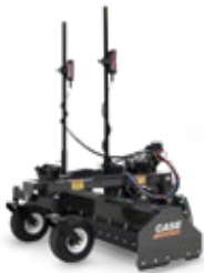
Laser Grading Box