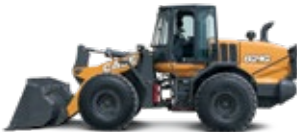
Large Wheel Loaders