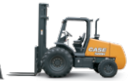
Rough Terrain Forklifts