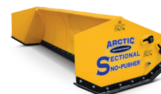
Arctic® Sectional Sno-Pusher™