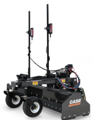
Laser Grading Box