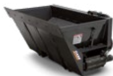
Side Discharge Bucket