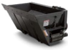
Side Discharge Bucket