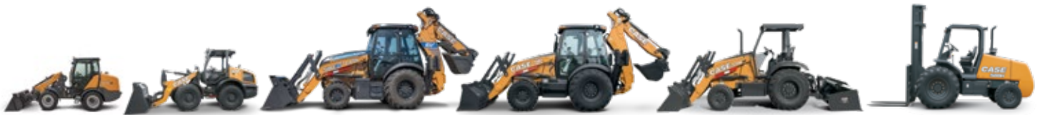
Small Articulated Loaders