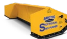
Arctic® Sectional Sno-Pusher™