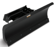
6-Way Dozer Blade