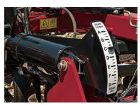
Hydraulic fore/aft control: maintain consistent agronomic output.