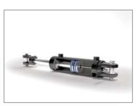
Internally mounted sensing technology: precise control and feedback.