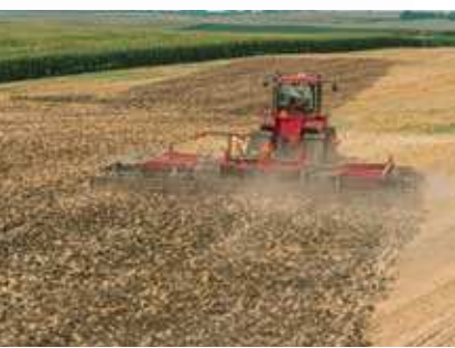
Preset adjustments: maximize every acre.