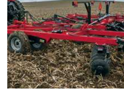
Disk gang depth: slice, cut and bury residue to the producer's desire.