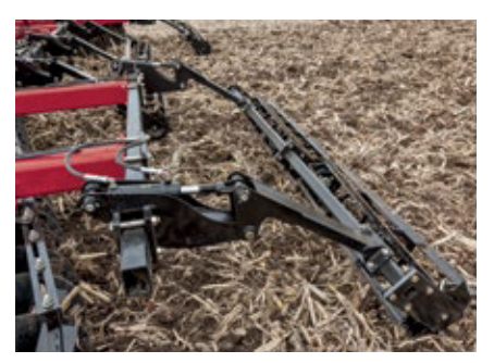
Crumbler pressure: achieve consistent clod sizing and finish.