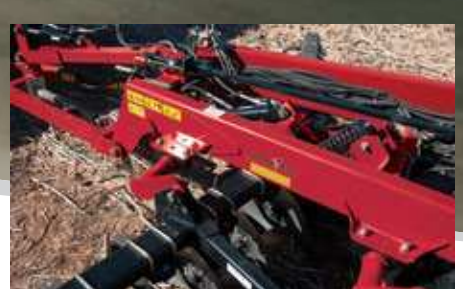
Disk gang depth: create agronomic residue cover