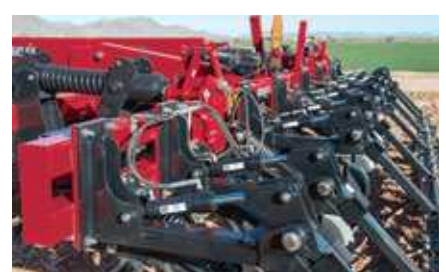
Crumbler pressure: achieve consistent clod sizing