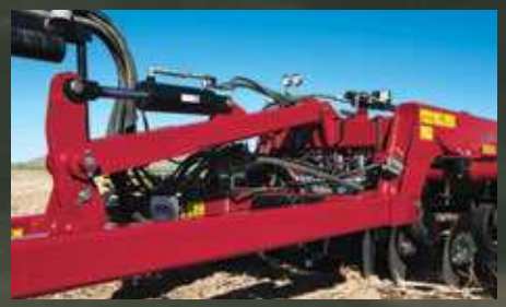
New hydraulic fore/aft positioning: maintain consistent agronomic output