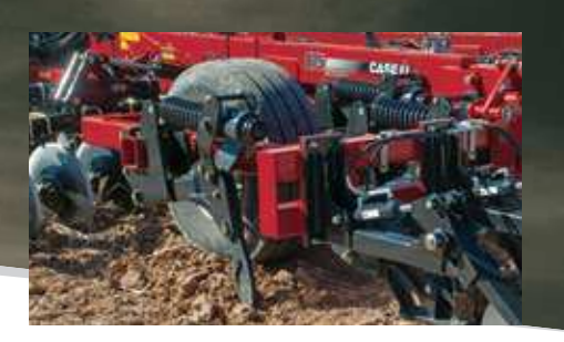
Shank depth: target the compaction layer