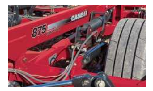
Coordinated control: optimize all components