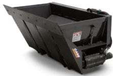
Side Discharge Bucket