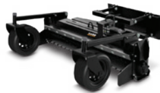
Power Rake (Soil Conditioner)