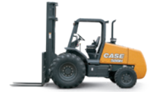
Rough Terrain Forklifts