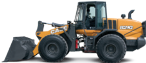
Large Wheel Loaders