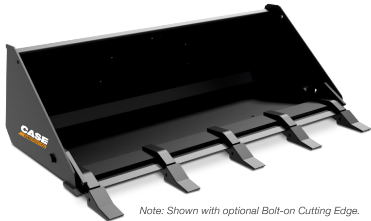
Note: Shown with optional Bolt-on Cutting Edge.