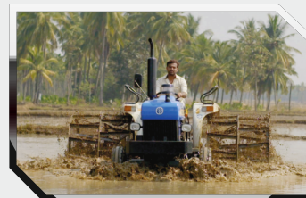
Full Cage Wheel