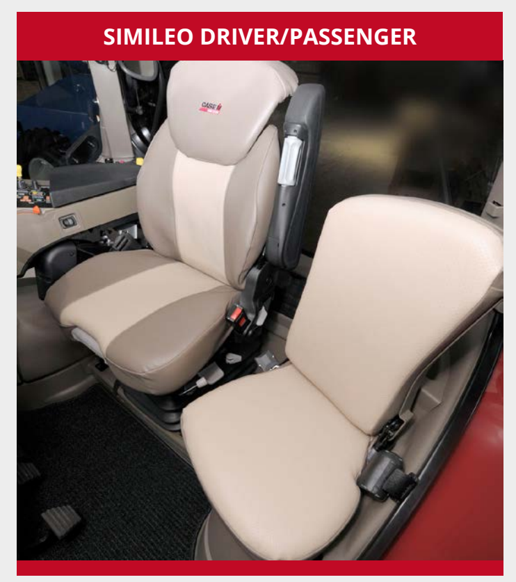
Ask your local CASE IH dealer to advise on the recommended seat cover needed for your driver or passenger seat.